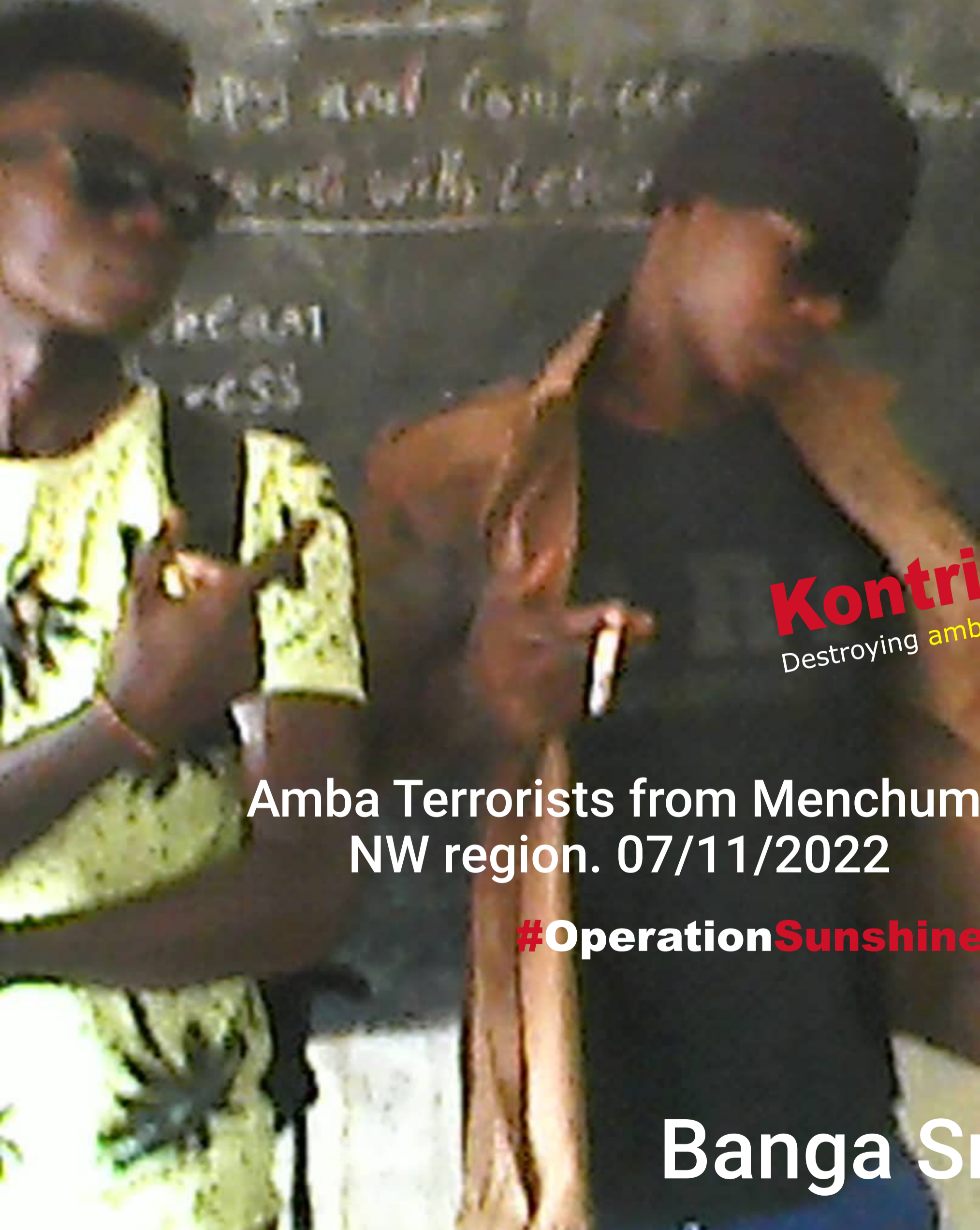
Amba Terrorists from Menchum, NW region. 07/11/2022